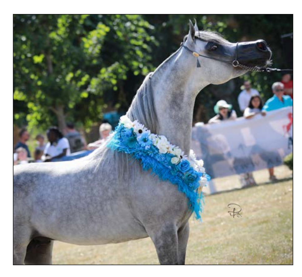
Sundown KA (QR Marc x L Serenella)