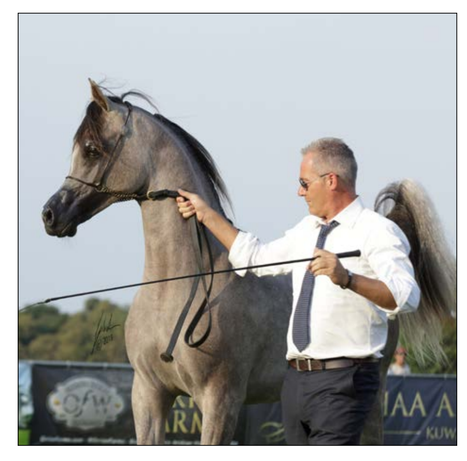
Poseidon KA (Equibron KA x Primera Marc)