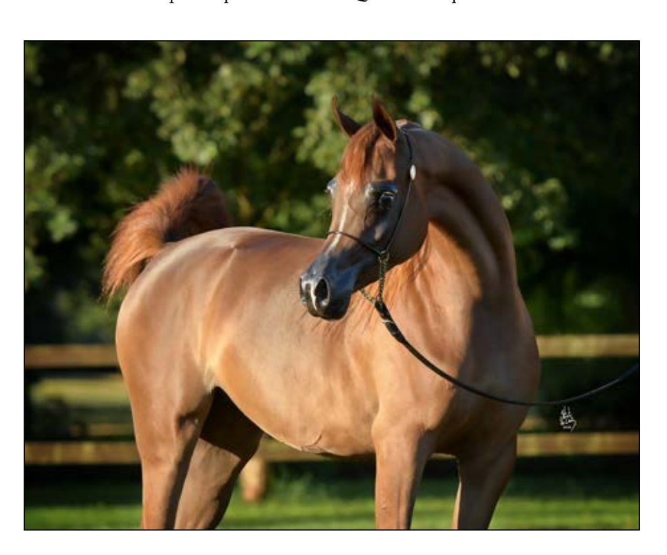
Talitha KA (OR Marc x Harmattan Thalya)

Then, it was time for the World Championships in Paris and once more, this continued to be a good show for QR Marc. Equator was named World