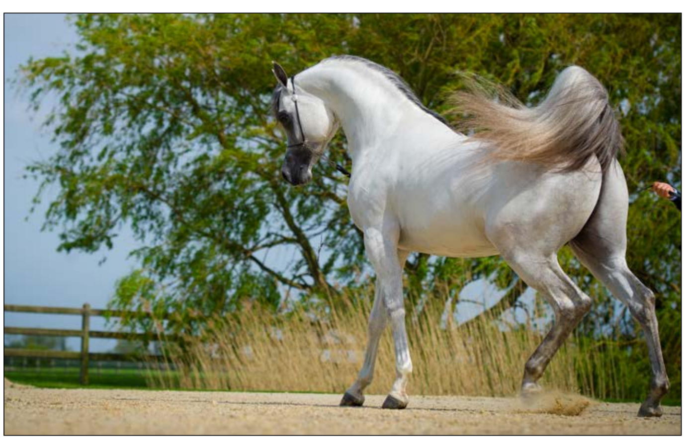
Equiborn KA (QR Marc x Espadrilla)