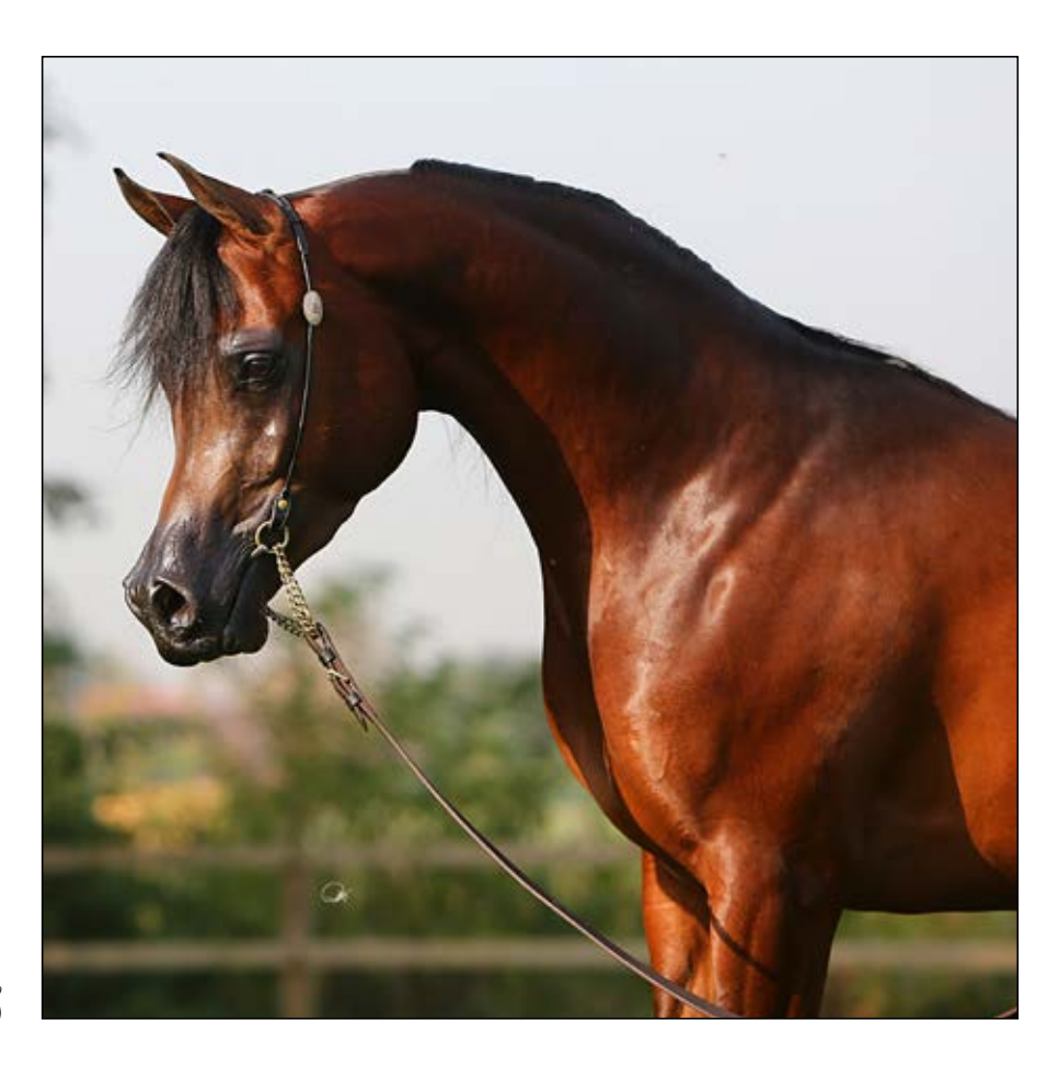
Espressivo (QR Marc x Emocja)

out of Emigracja), Reserve Junior Male Champion at Al Khalediah Arabian Horse Festival and now sold to Iran, where he is making a positive influence on local breeding prgorammes; Emanos KA (ex Emantka by Eukaliptus out of Emanta), Bronze Junior Male Champion at the Dubai International Arabian Horse Championships; Pavorotto KA (ex Palanga), Gold Junior Male Champion at the Deauville Breeders' Cup Finals and now owned by Rohara Arabians; and the brilliant grey son, Equiborn KA (ex Espadrilla by Monogramm out of Emancja), a double Silver World Champion as a junior among his many titles.