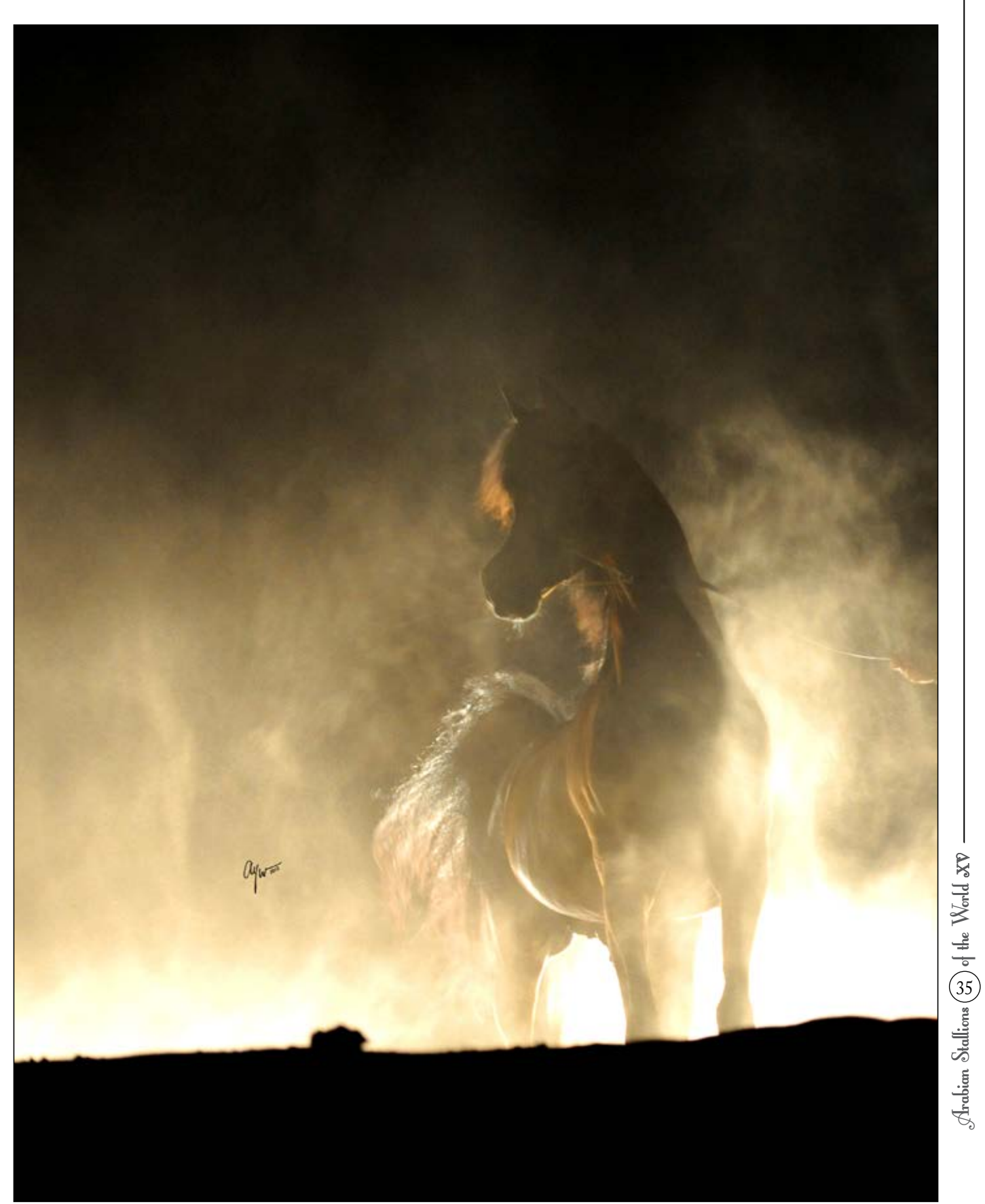
QR Marc (Marwan Al Shaqab x Swete Dreams)