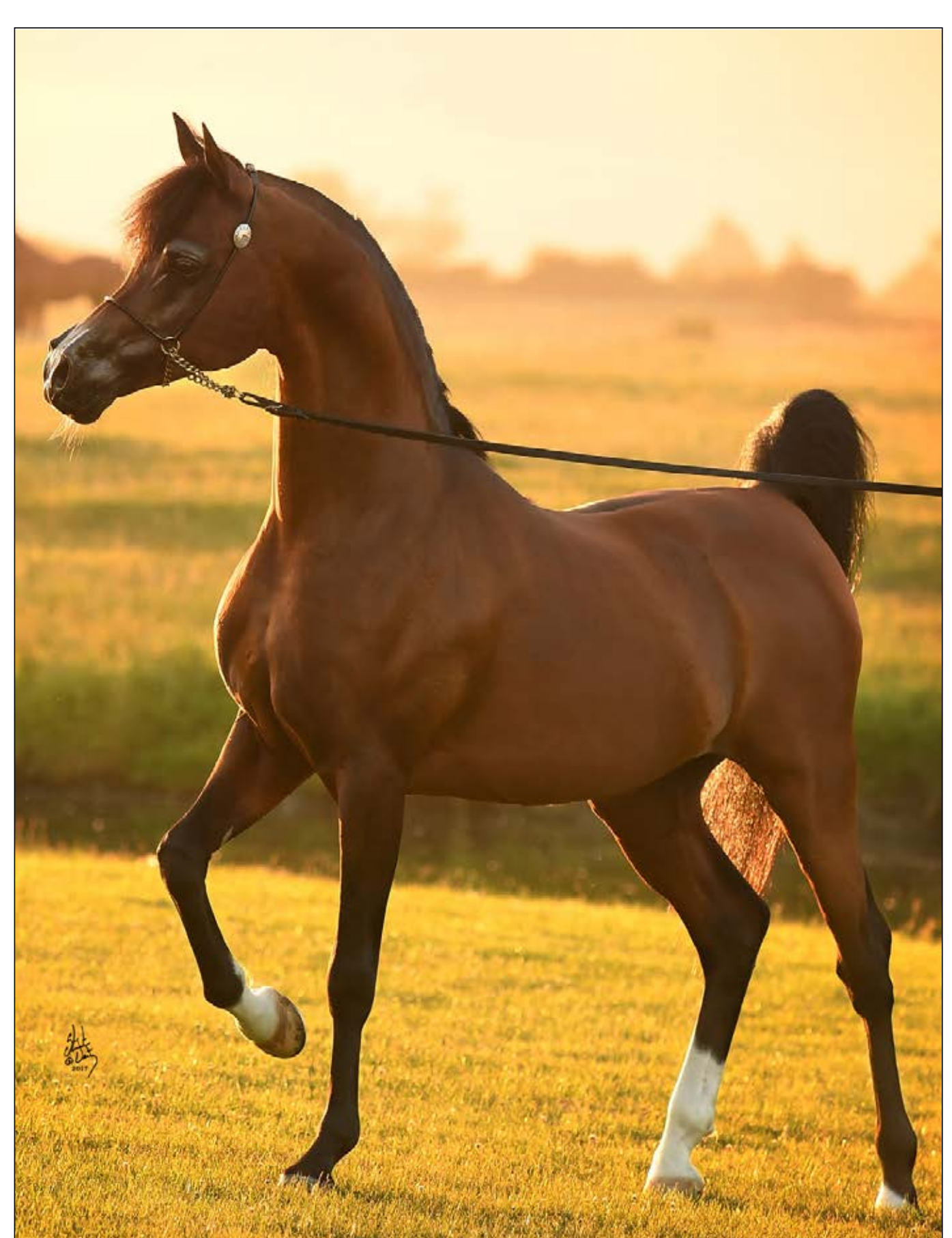
Arabian Stallions (6) of the World XV